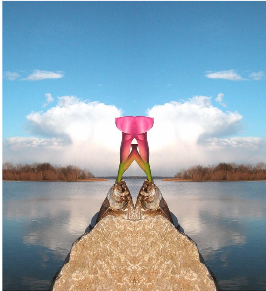
Carpio kallos, Hybrid 1