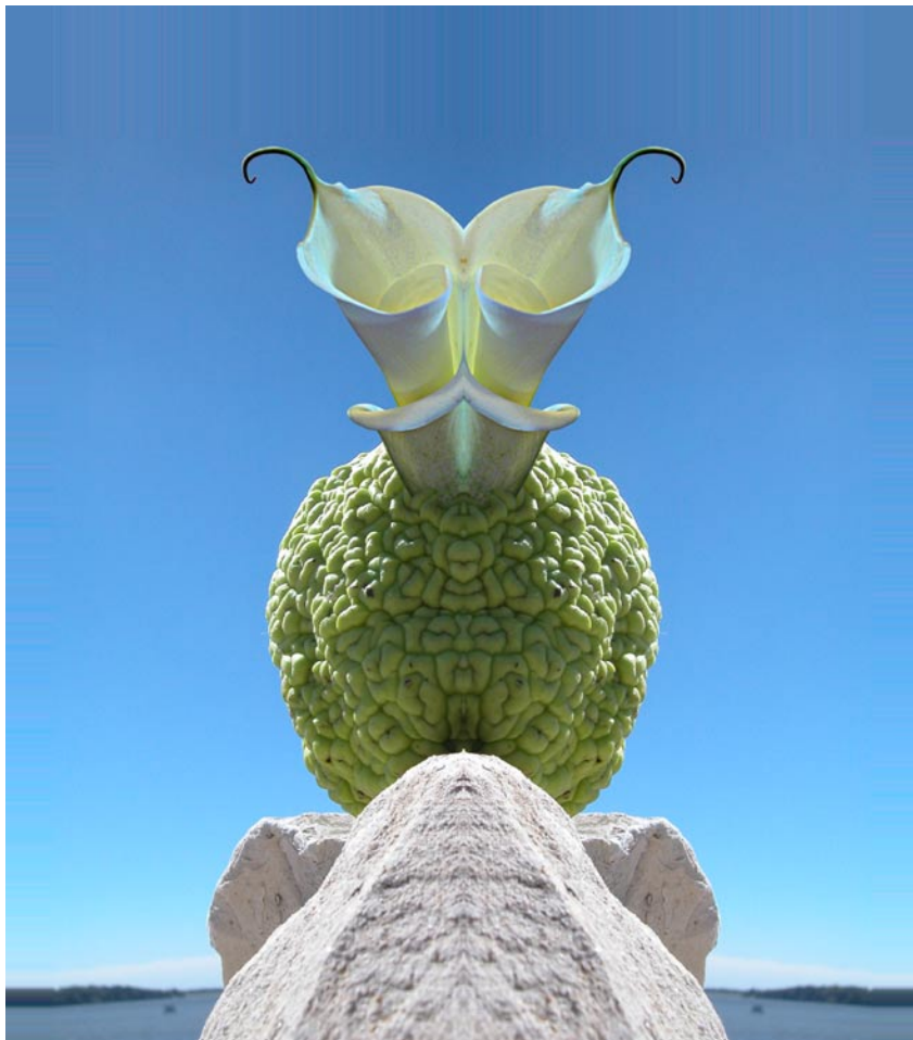
Calla pomifera x